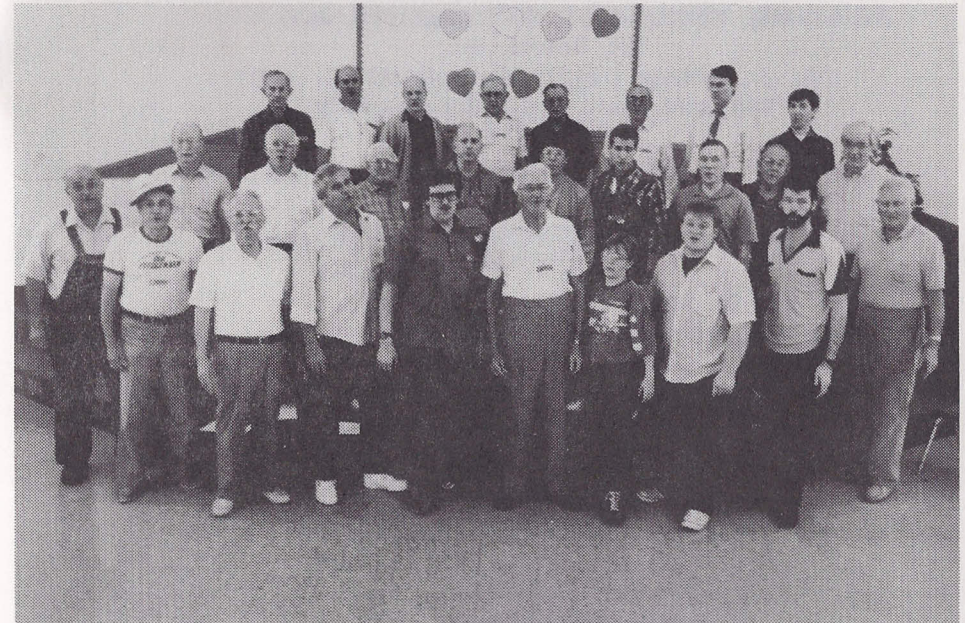
THE FORT WALTON BEACH EMERALD COAST CHORUS